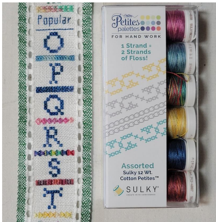
712-07 Most Popular Color Collection