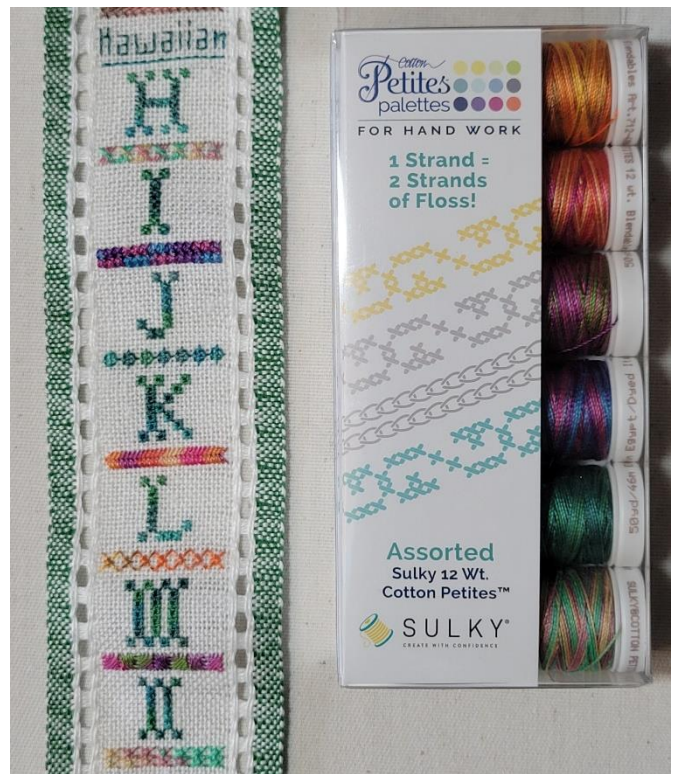
712-171 Hawaiian Tropics