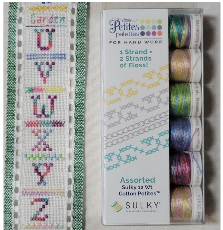
712-172 Garden Party