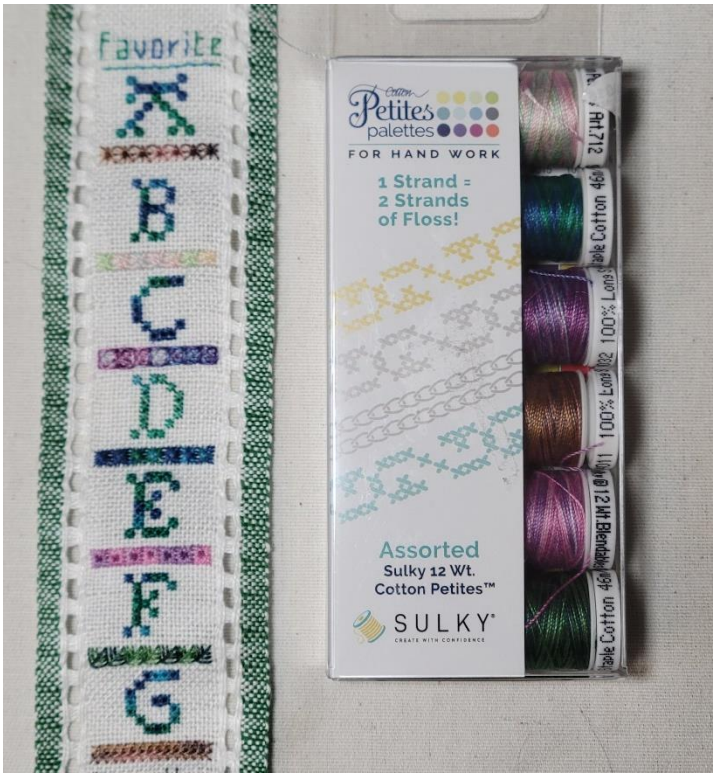
712-12 Favorites Sampler Collection